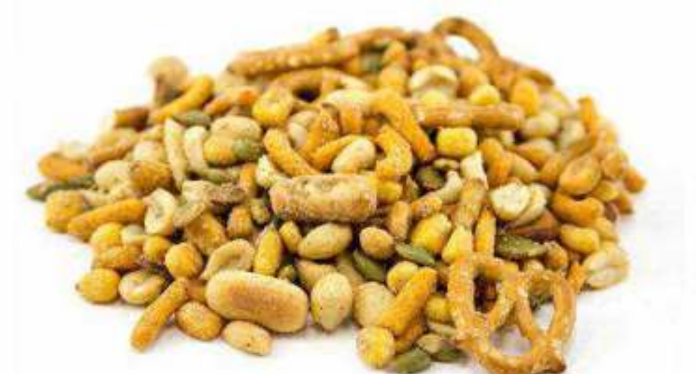
L'ORENTA CRUNCH MINIATURE RYE ROAST, MUSTARD PRETZELS, TOASTED CORN, R/S PEANUTS, R/S PUMPKIN SEEDS.