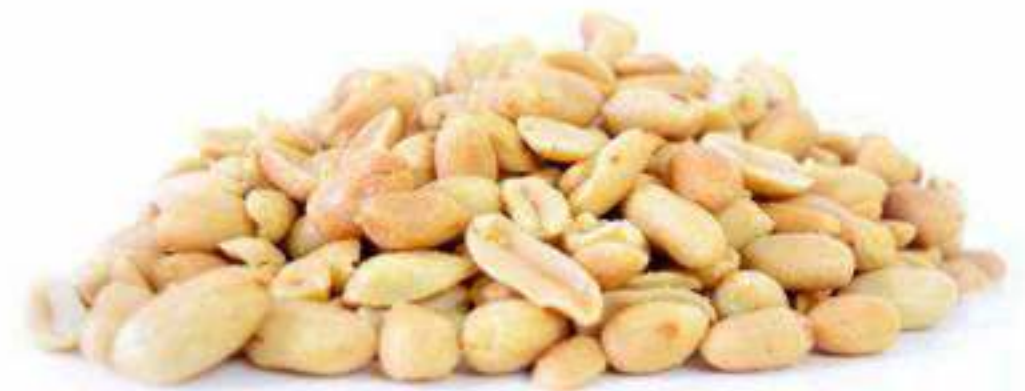
ROASTED AND SALTED PEANUTS ROASTED AND SALTED JUMBO PEANUTS.