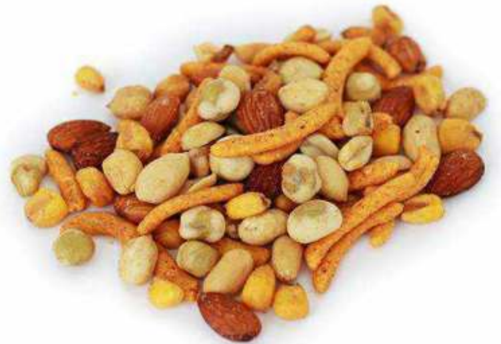
LOLA'S CRUNCH MIX R/S PEANUTS, R/S ALMONDS, TOASTED CORN, CAJUN STICKS, WASABI PEAS.