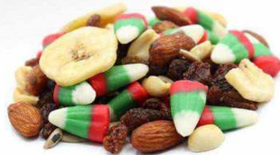
HOLIDAY TRAIL MIX SWEETENED BANANAS, RAISINS, ROASTED AND SALTED PEANUTS, SUNFLOWER SEEDS AND CANDY CORN