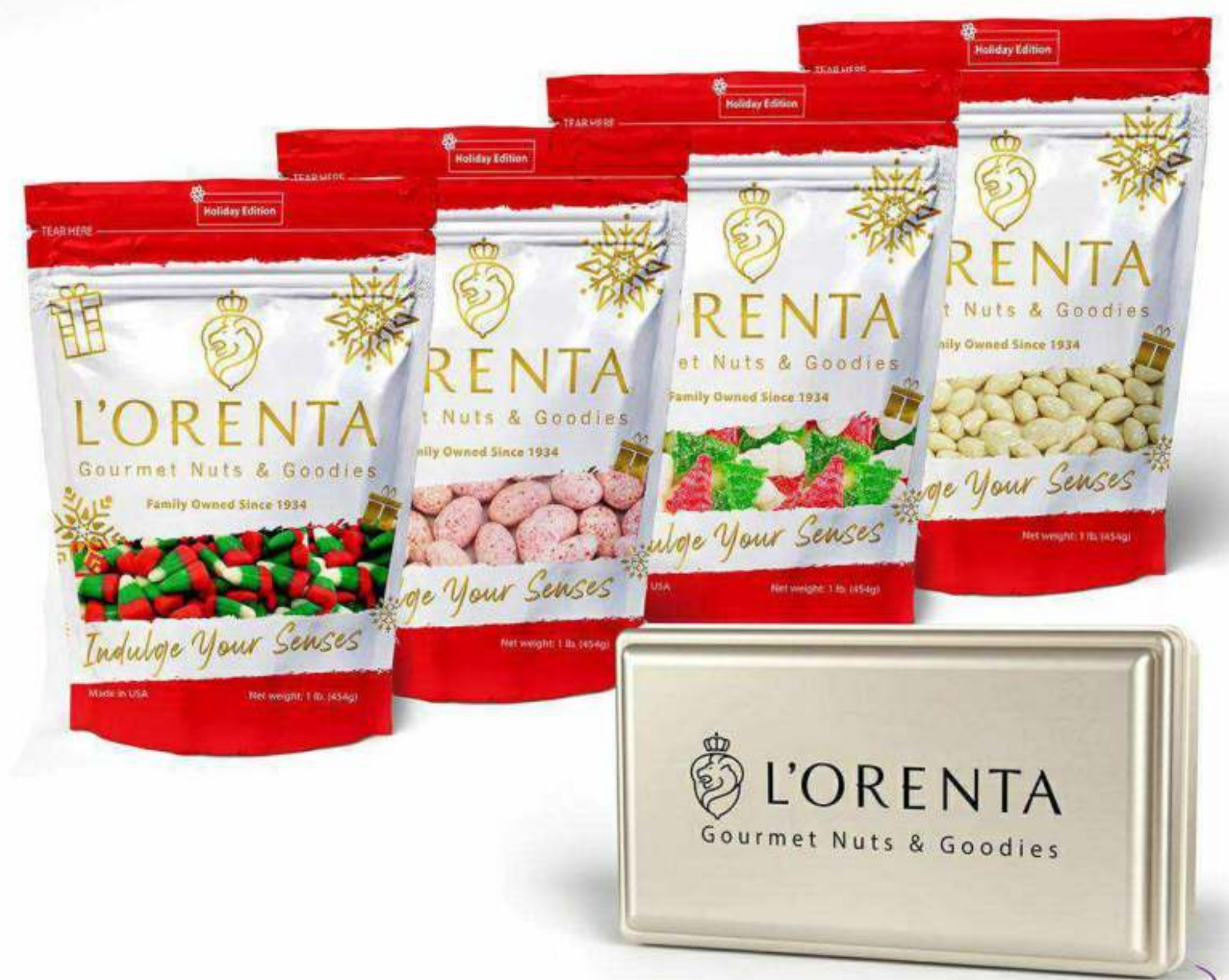
Prancer's Party! Holiday Gift Set ~ 5.5 Pounds