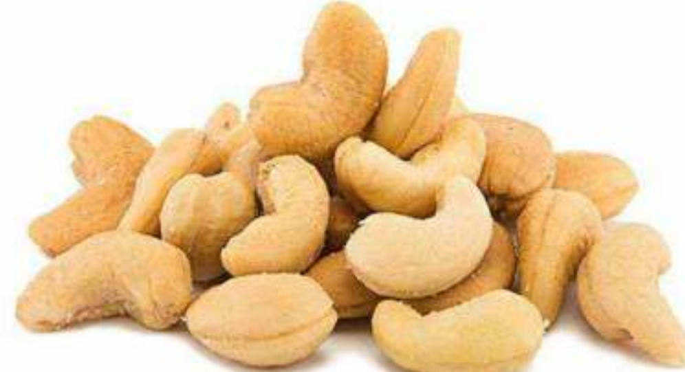
ROASTED AND SALTED CASHEWS (TEXAS SIZED) VERY LARGE CASHEWS, CREAMY AND BUTTERY FLAVOR.