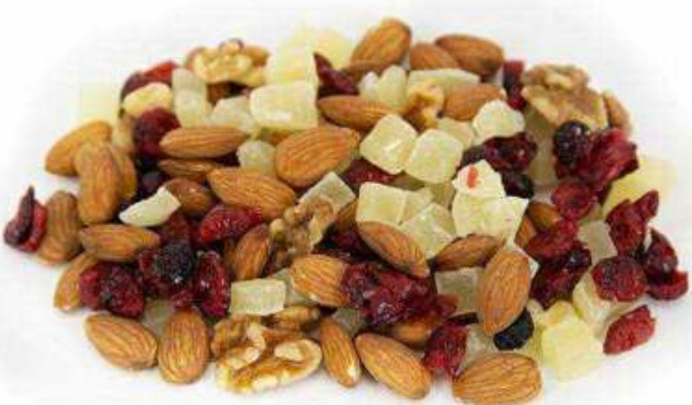
BERRY ALMOND MIX R/S ALMONDS, DICED PINEAPPLES, DRIED CRANBERRIES, WALNUT HALVES, SEEDLESS RAISINS.