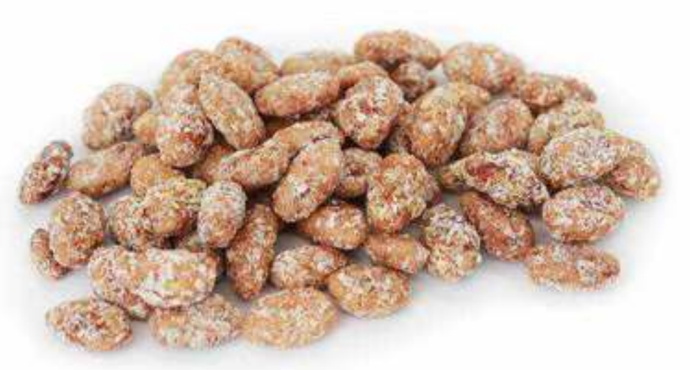
ALMOND COCONUT MACAROON COATED ALMONDS WITH A TOFFEE SHELL. FINISHED WITH A DUSTING OF FINELY SHREDDED COCONUT.