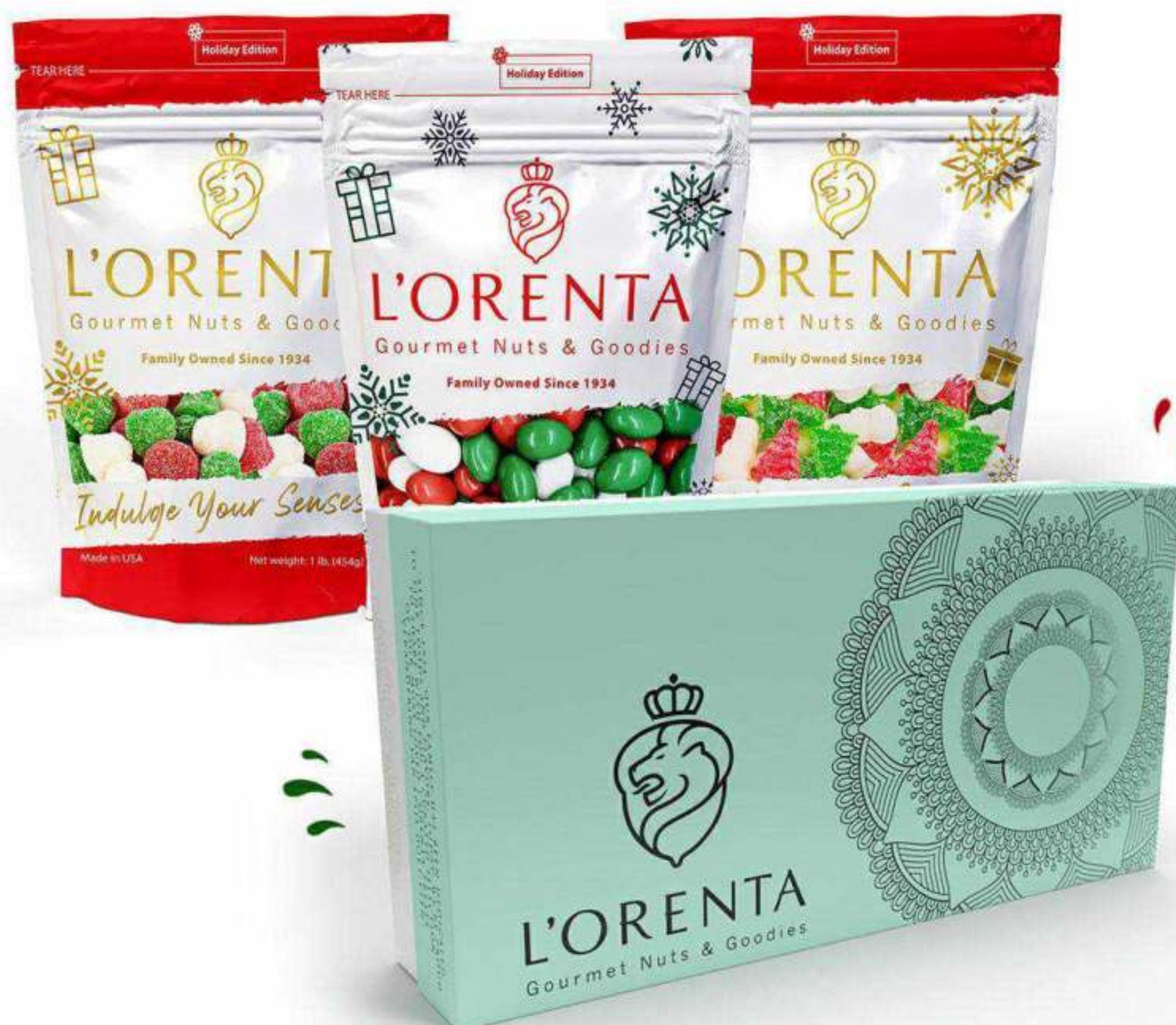
Green & Red Delight Holiday Gift Set ~ 5 Pounds