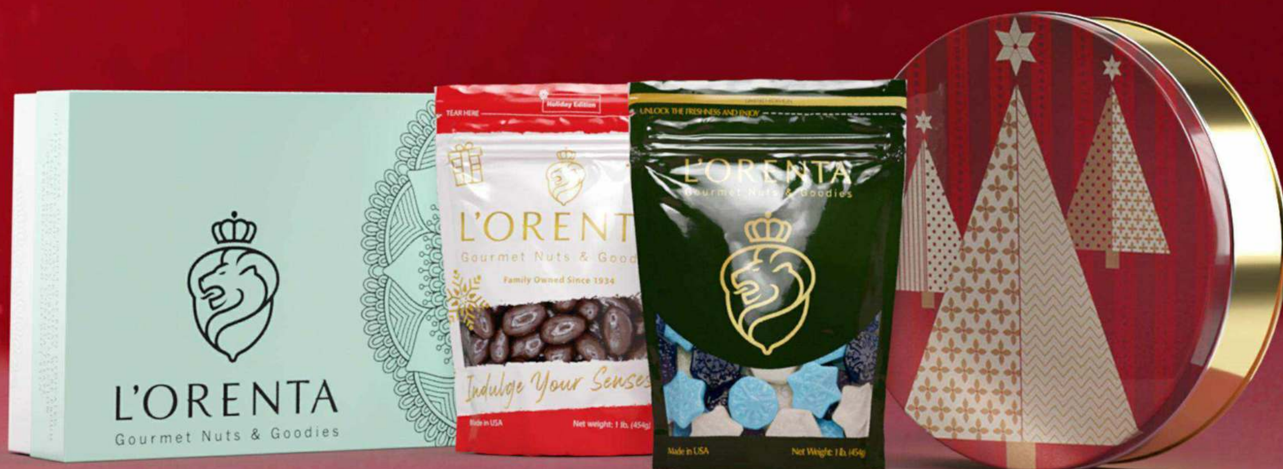
2 Pound Variety Box