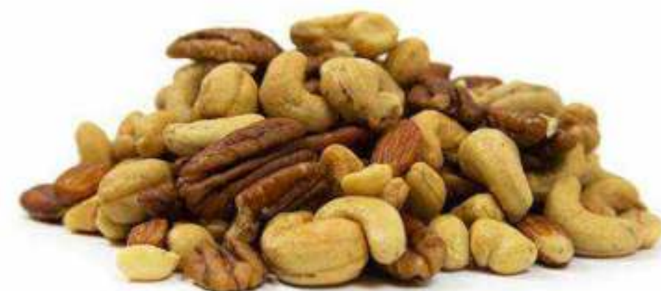
MIXED NUTS WITH PEANUTS R/S PEANUTS, R/S ALMONDS, R/S CASHEWS, NATURAL PECAN HALVES.