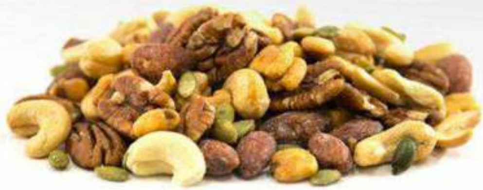
RIVERCITY 5 STAR R/S ALMONDS, R/S CASHEWS, R/S PUMPKIN SEEDS, TOASTED CORN, NATURAL PECAN HALVES.