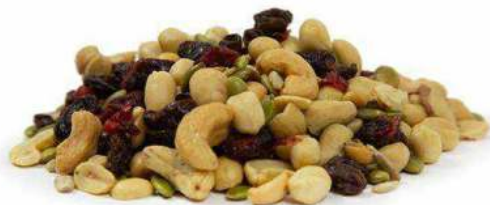
MOUNTAIN MIX OUR SIGNATURE MIX. R/S CASHEWS, R/S PEANUTS, R/S PUMPKIN SEEDS, DRIED CRANBERRIES, SEEDLESS RAISINS.