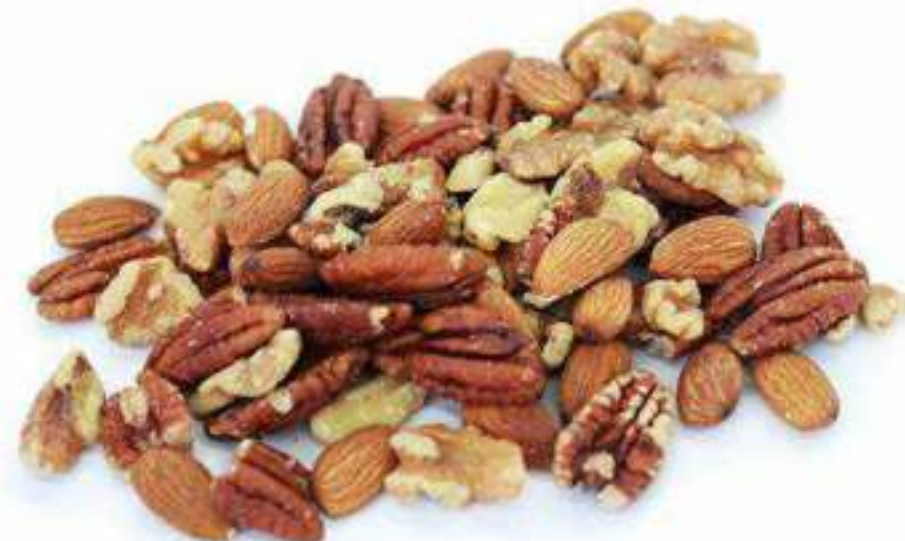
KETO MIX NATURAL PECAN HALVES, WHOLE NATURAL ALMONDS, WALNUT HALVES.