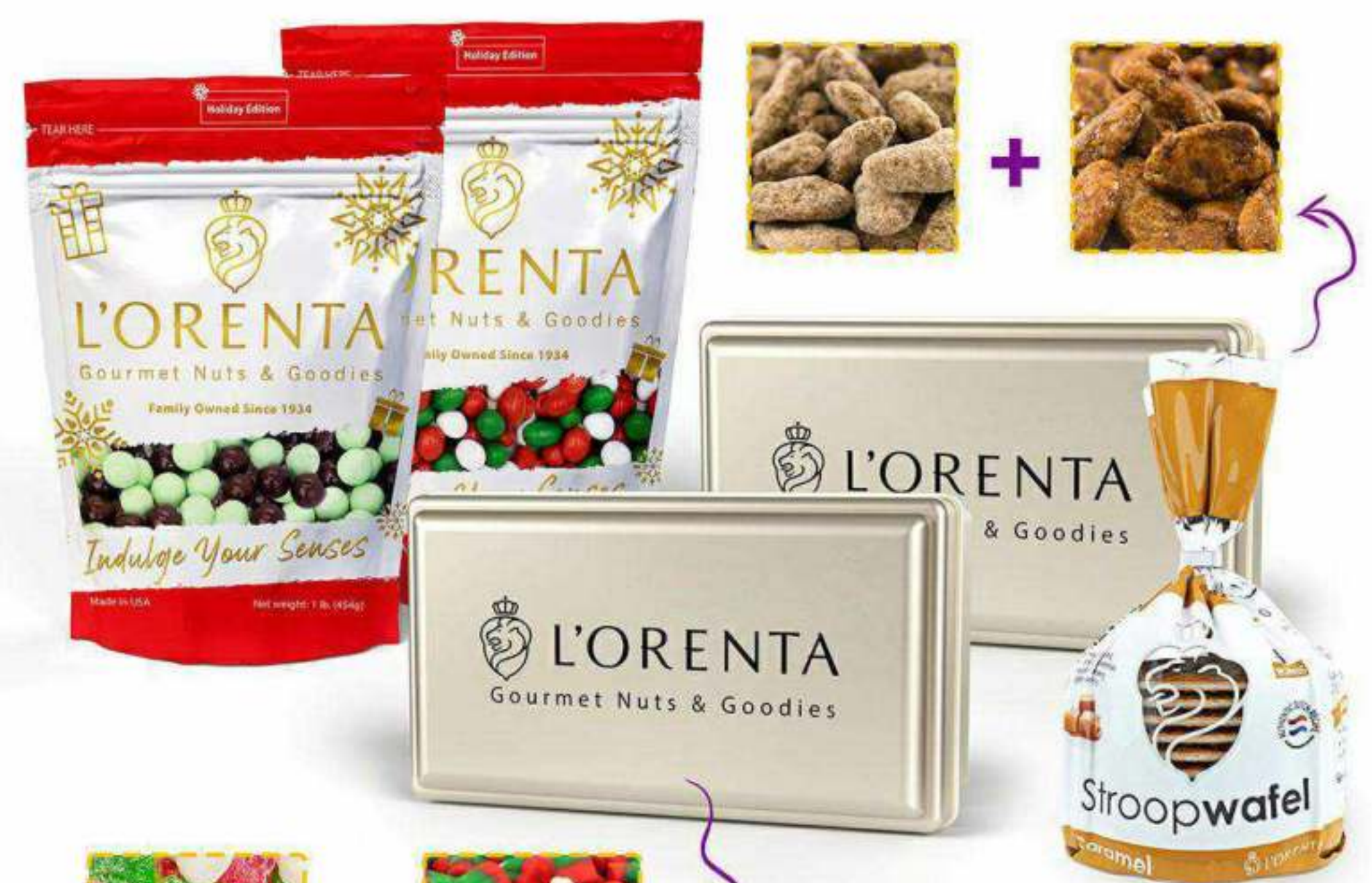
Texas T Treats Holiday Gift Set ~ 5.5 Pounds