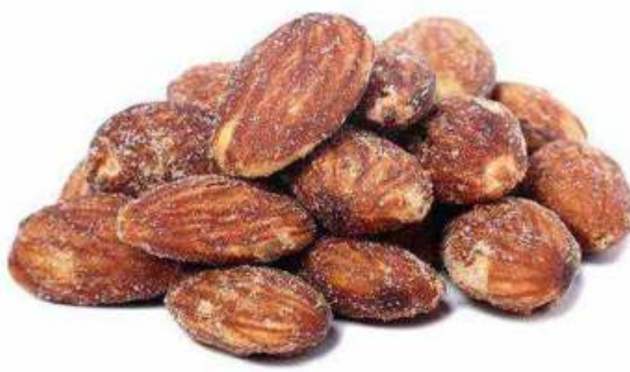
ROASTED AND SALTED ALMONDS ROASTED AND SALTED ALMONDS.