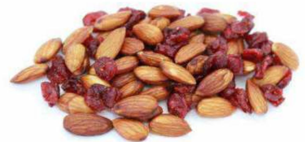
MIKE'S MIX R/S ALMONDS, DRIED CRANBERRIES.