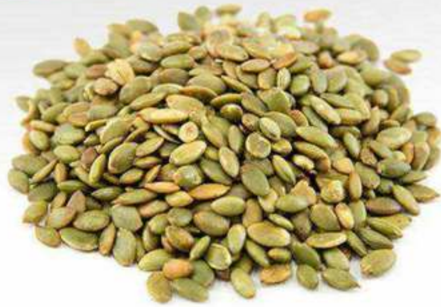
ROASTED AND SALTED PUMPKIN SEEDS ROASTED AND LIGHTLY SALTED PUMPKIN SEEDS.