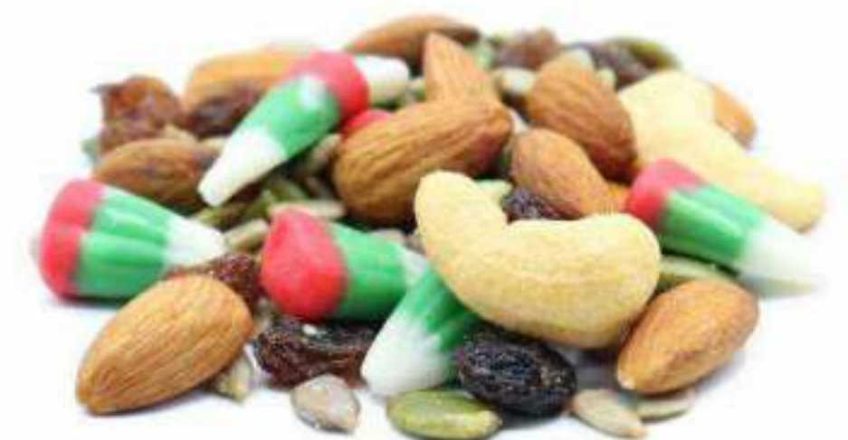
REINDEER TRAIL MIX ROASTED AND SALTED ALMONDS & CASHEWS, RAISINS, PUMPKIN SEEDS AND SUNFLOWER SEEDS AND CANDY CORN