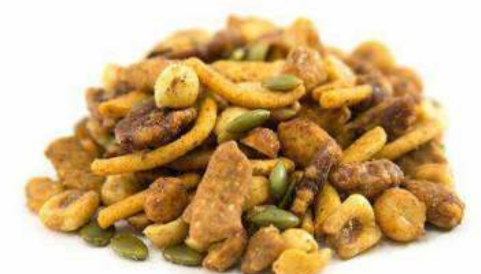
SOUTH TEXAS HEAT OUR TOP SELLING MIX. A COMBINATION OF SWEET, SALTY AND SPICY.