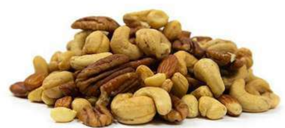
MIXED NUTS WITH PEANUTS R/S PEANUTS, R/S ALMONDS, R/S CASHEWS, NATURAL PECAN HALVES.