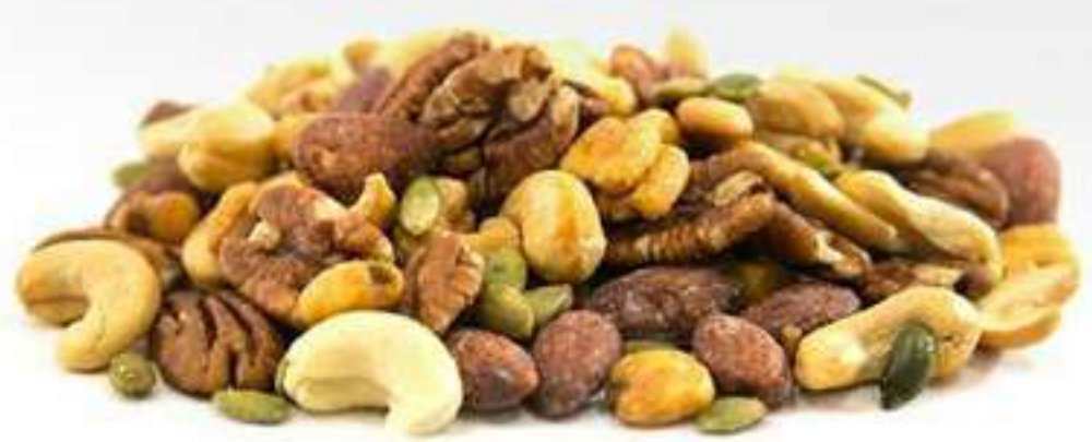
RIVERCITY 5 STAR R/S ALMONDS, R/S CASHEWS, R/S PUMPKIN SEEDS, TOASTED CORN, NATURAL PECAN HALVES.