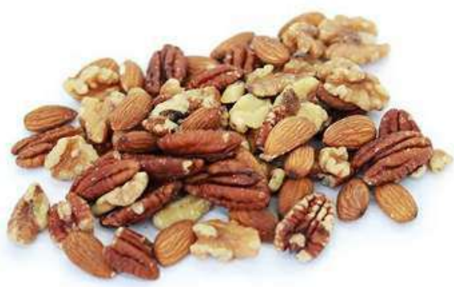
KETO MIX NATURAL PECAN HALVES, WHOLE NATURAL ALMONDS, WALNUT HALVES.