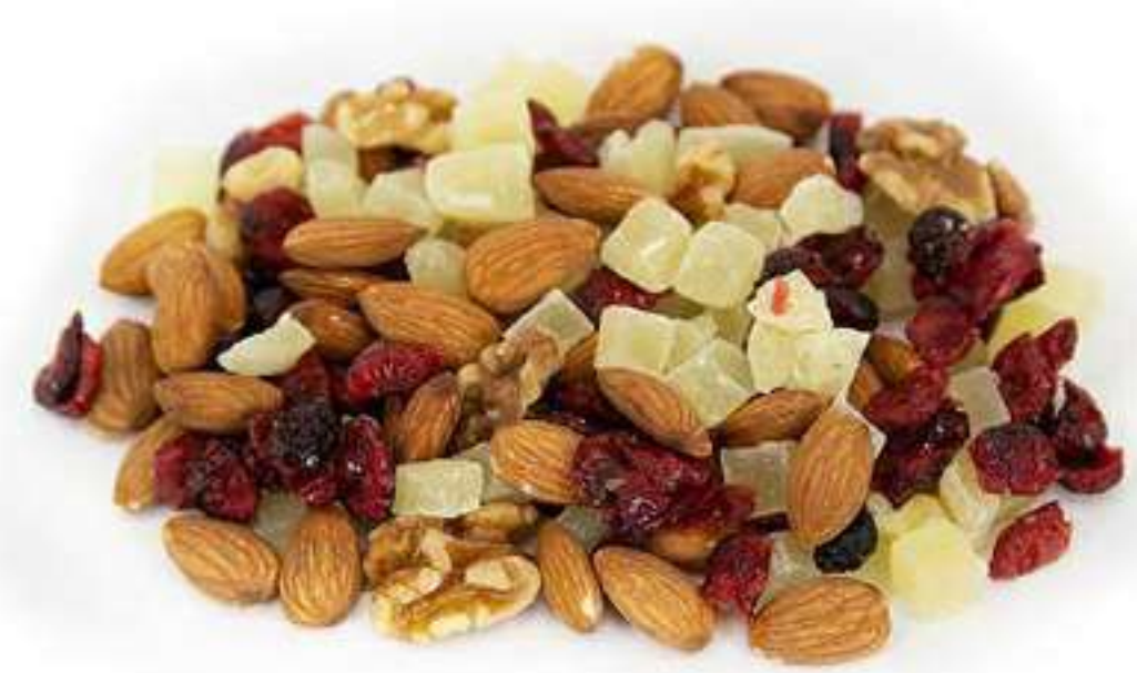
BERRY ALMOND MIX R/S ALMONDS, DICED PINEAPPLES, DRIED CRANBERRIES, WALNUT HALVES, SEEDLESS RAISINS.