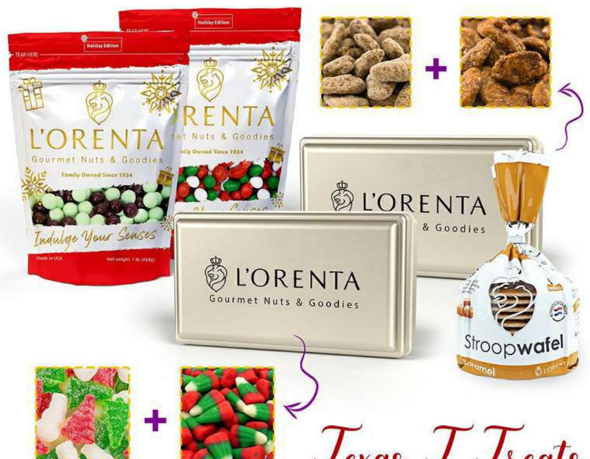
Texas T Treats Holiday Gift Set ~ 5.5 Pounds