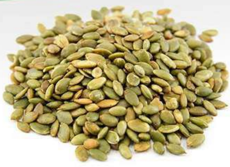
ROASTED AND SALTED PUMPKIN SEEDS ROASTED AND LIGHTLY SALTED PUMPKIN SEEDS.