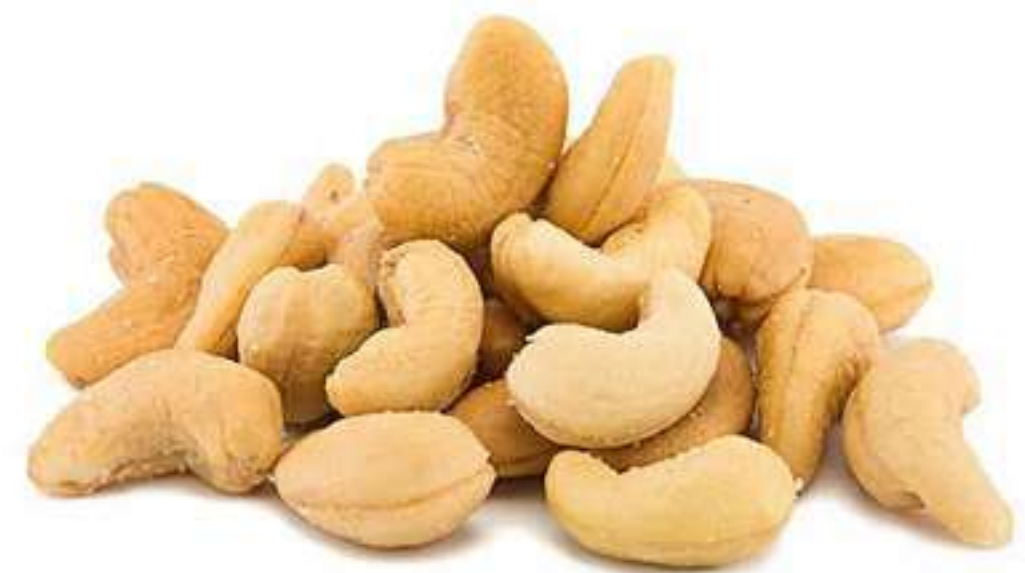
ROASTED AND SALTED CASHEWS (TEXAS SIZED) VERY LARGE CASHEWS, CREAMY AND BUTTERY FLAVOR.