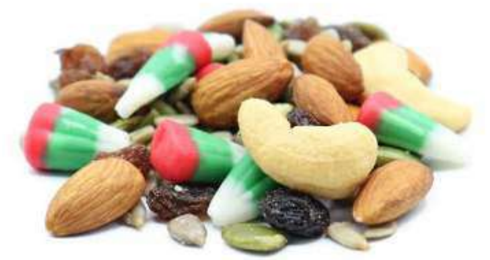
REINDEER TRAIL MIX ROASTED AND SALTED ALMONDS & CASHEWS, RAISINS, PUMPKIN SEEDS AND SUNFLOWER SEEDS AND CANDY CORN