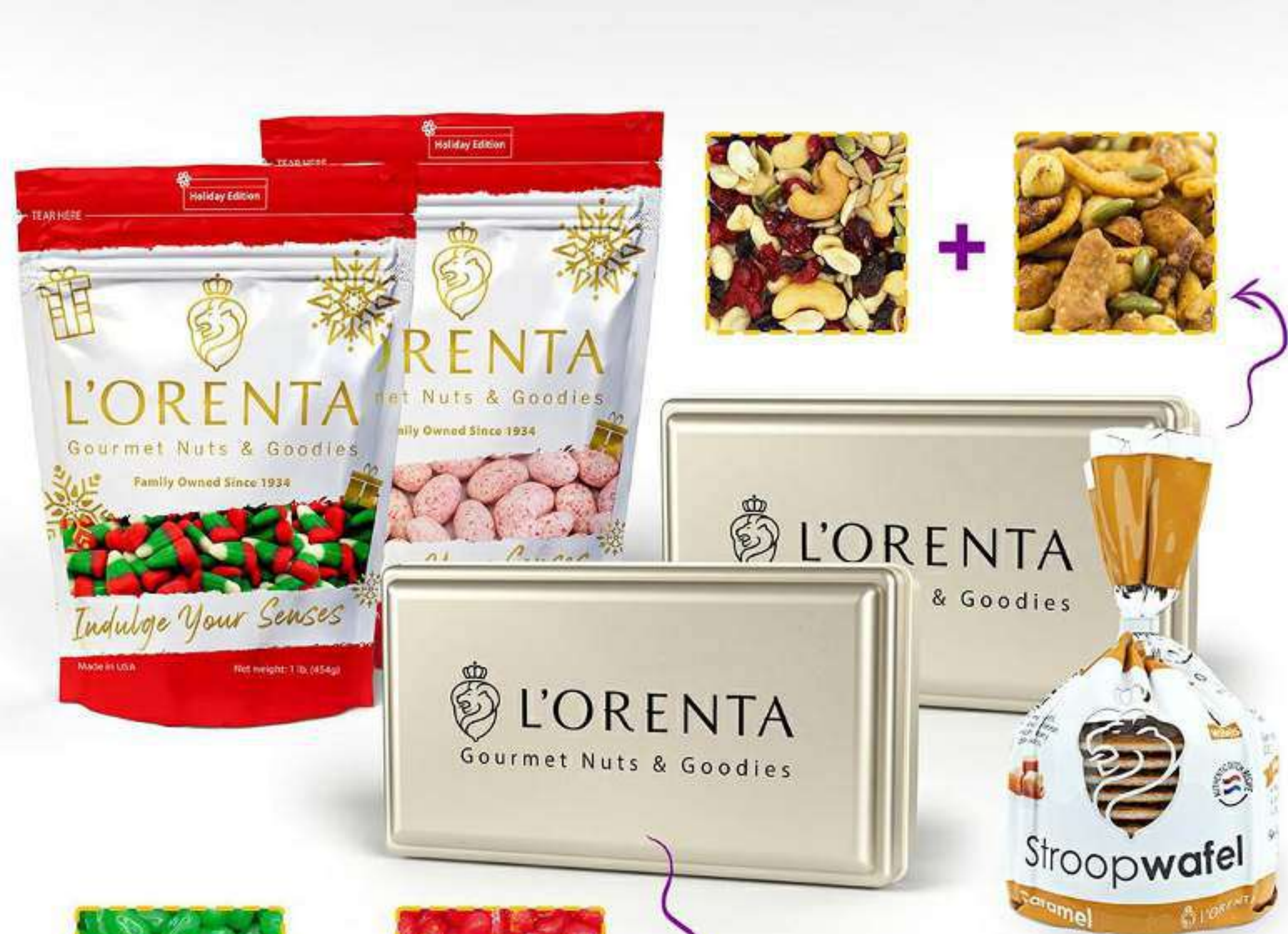
December Magic Holiday Gift Set ~ 5.5 Pounds

100+ Gift Sets Available www.lorentanuts.com