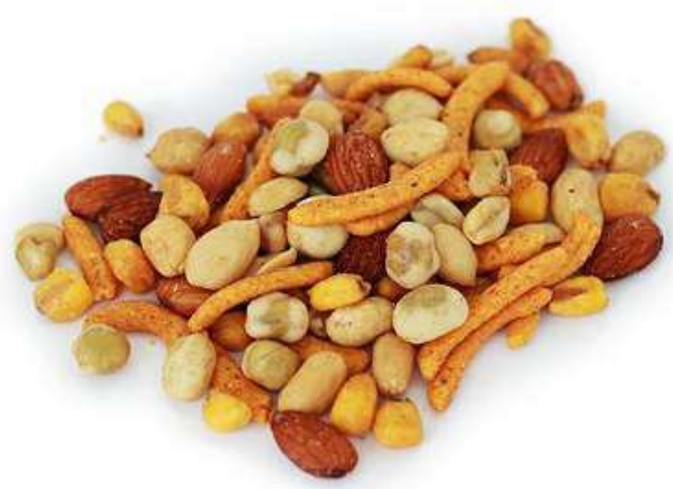
LOLA'S CRUNCH MIX R/S PEANUTS, R/S ALMONDS, TOASTED CORN, CAJUN STICKS, WASABI PEAS.