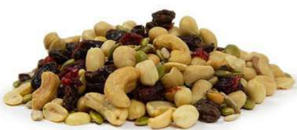
MOUNTAIN MIX OUR SIGNATURE MIX. R/S CASHEWS, R/S PEANUTS, R/S PUMPKIN SEEDS, DRIED CRANBERRIES, SEEDLESS RAISINS.