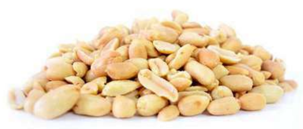
ROASTED AND SALTED PEANUTS ROASTED AND SALTED JUMBO PEANUTS.