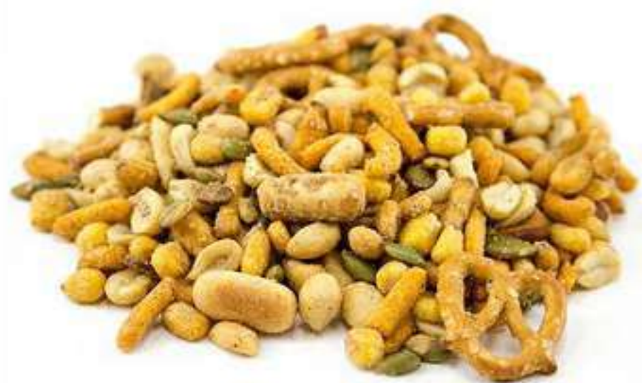
L'ORENTA CRUNCH MINIATURE RYE ROAST, MUSTARD PRETZELS, TOASTED CORN, R/S PEANUTS, R/S PUMPKIN SEEDS.