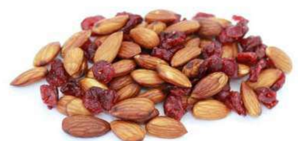
MIKE'S MIX R/S ALMONDS, DRIED CRANBERRIES.