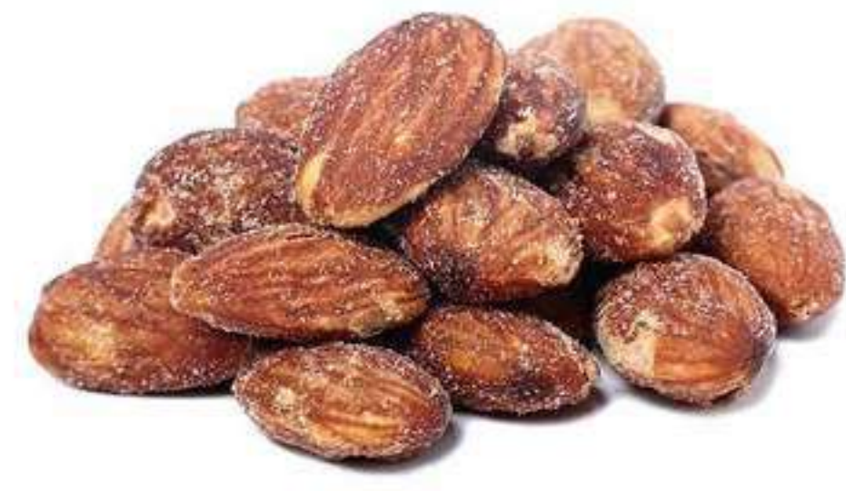
ROASTED AND SALTED ALMONDS ROASTED AND SALTED ALMONDS.