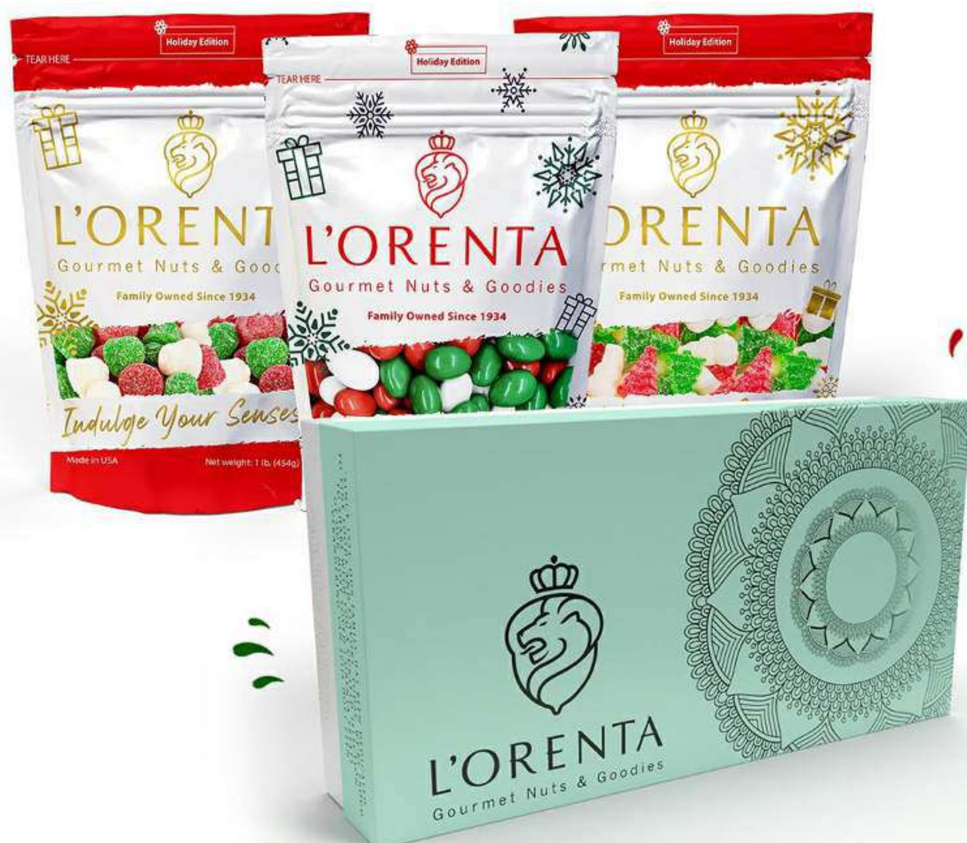
Green & Red Delight Holiday Gift Set ~ 5 Pounds