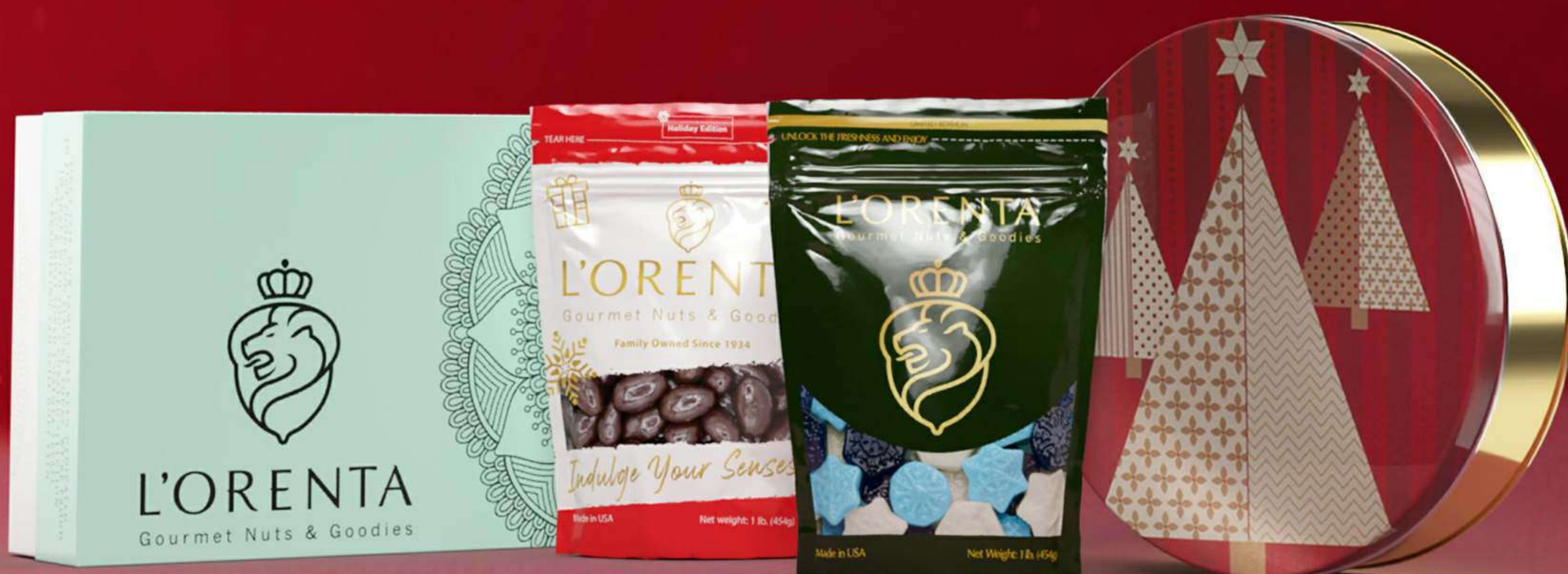
2 Pound Variety Box