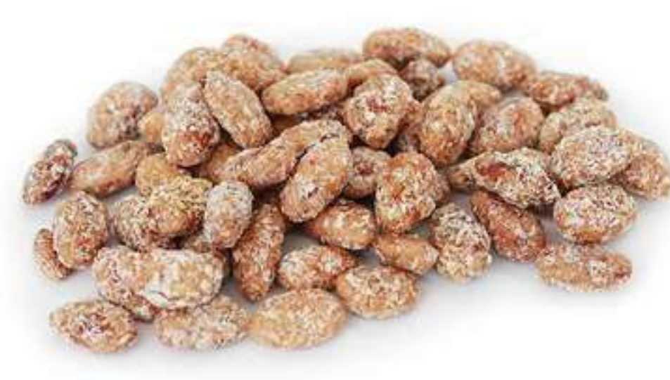
ALMOND COCONUT MACAROON COATED ALMONDS WITH A TOFFEE SHELL. FINISHED WITH A DUSTING OF FINELY SHREDDED COCONUT.