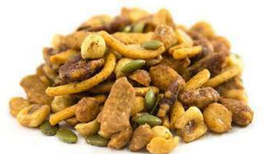
SOUTH TEXAS HEAT OUR TOP SELLING MIX. A COMBINATION OF SWEET, SALTY AND SPICY.