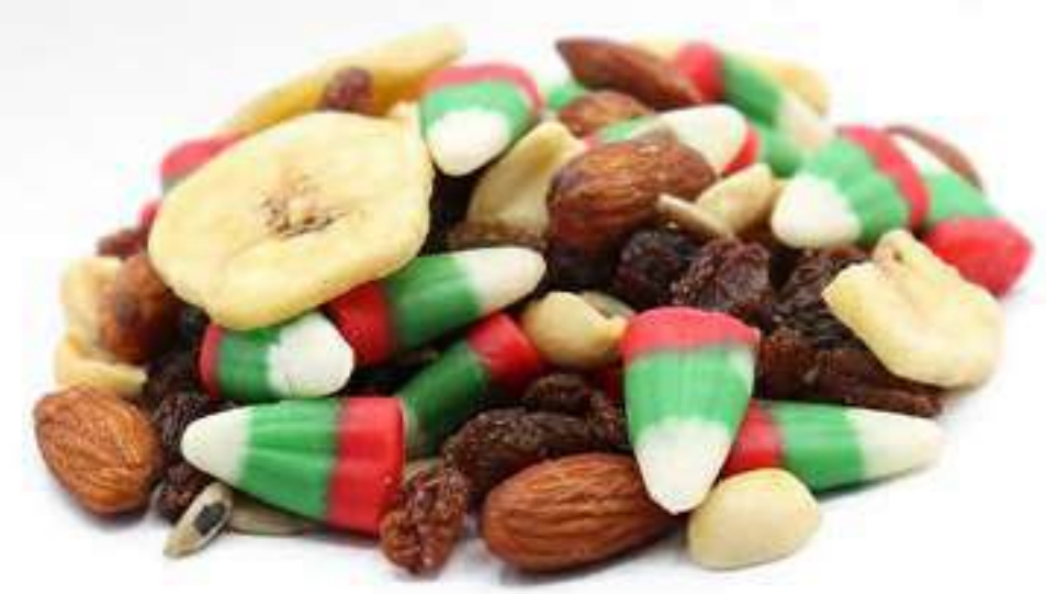
HOLIDAY TRAIL MIX SWEETENED BANANAS, RAISINS, ROASTED AND SALTED PEANUTS, SUNFLOWER SEEDS AND CANDY CORN