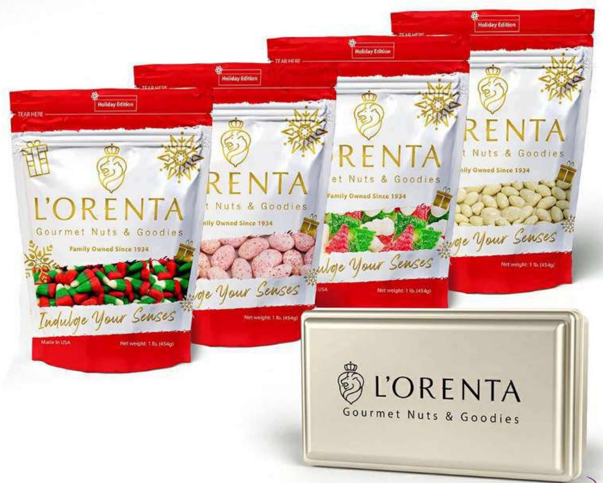
Prancer's Party! Holiday Gift Set ~ 5.5 Pounds